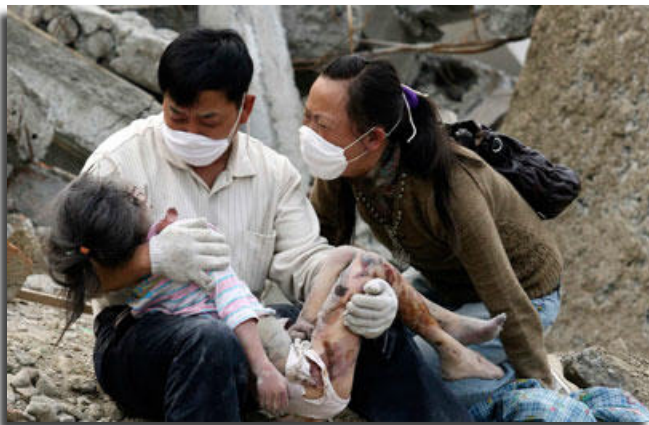
Parents cradle the body of their daughter who was found amidst the rubble of the Qushan kindergarten in Beichuan county

At this date, the death toll from the quake, which registered 8.0 on the Richter scale, stands at 69,146, with 17,516 still missing.